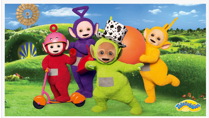
The Teletubbies now

acrylic paint with an overpoweringly strong smell. In the more recent series, Tubby Custard was