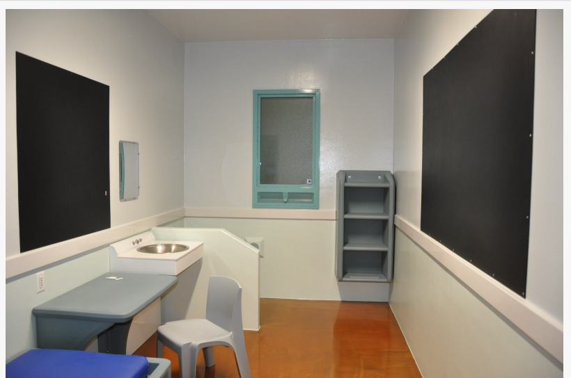
Mental Health and Juvenile Units

SteelCell of North America, Inc. based in Baldwin Georgia listened carefully when several correctional facility administrators started asking for a more normalized living unit for Juveniles and for Behavioral Mental Health Prefabricated cells. SteelCell began to establish their own behavioral and mental health "method" where they aggregated data, developed innovate award-winning designs and products, and engaged experts to help guide these new environments.