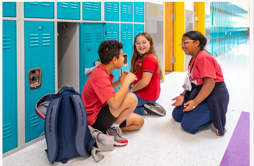
SST Students Enjoy Downtime Between Classes

With a distinct focus upon the academic and socio-emotional development of its students through a college preparatory, STEM-based learning model, the new location will adhere to the