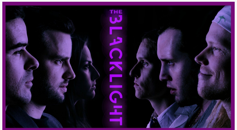
The Blacklight Promo