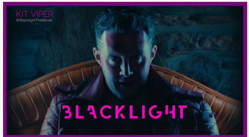
The Blacklight Promo 3