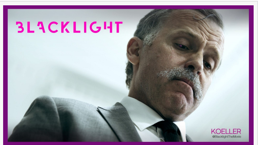
The Blacklight Promo 2

You can see the hard work pay off for itself by experiencing THE BLACKLIGHT on the big screen. Its initial run ends on March 31, but those in the Midwest will have another chance to see it throughout April as it tours through various towns in Oregon, and Battle Ground, Washington. You can check out official dates and showtimes by clicking HERE