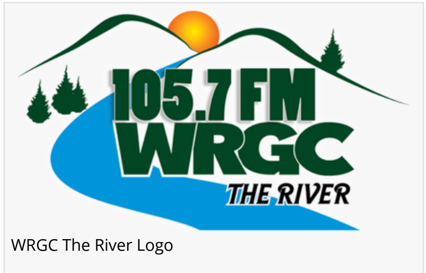
WRGC The River Logo