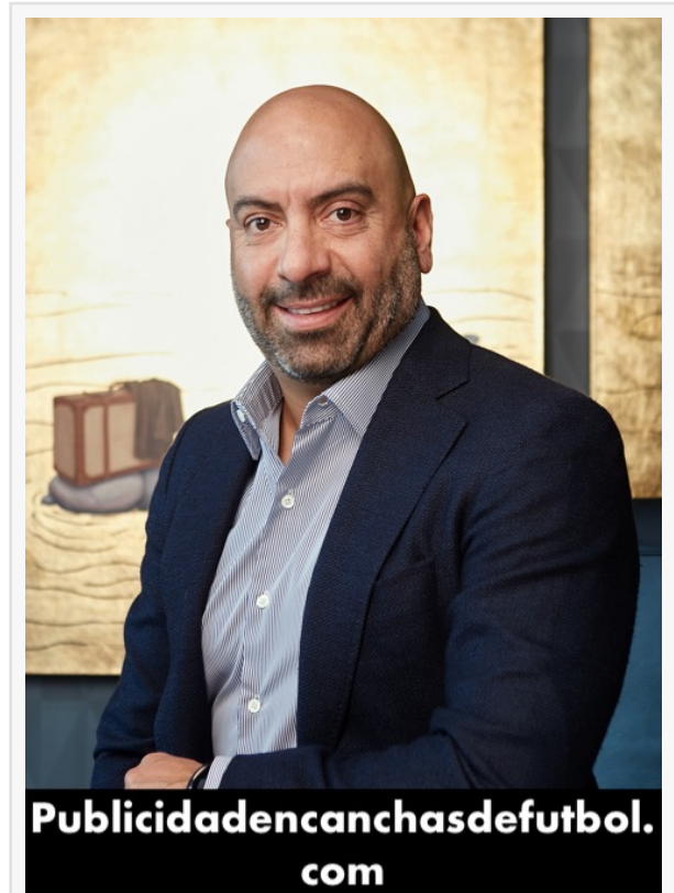
Jose Eshkenazi Publicidad en canchas de futbol

Today, brands are looking to offer rewards and added value to enrich the consumer experience and guarantee recurrence; with TREBEL, your brand can offer a music service to maximize loyalty and build digital relationships that maximize loyalty and return on advertising investment.