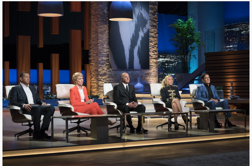
Shark Tank's Kevin O'Leary, AKA Mr. Wonderful, Does The Deal With BenjiLock!