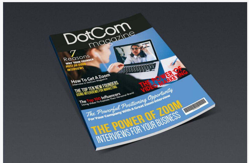
DotCom Magazine "The Zoom Interview Issue"