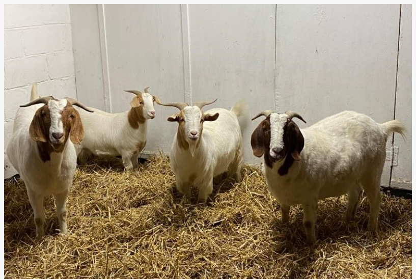
New Goats pictured in isolation on arrival

INGATESTONE, ESSEX, UK, March 30, 2022 /EINPresswire.com/ -- Remus Horse Sanctuary has literally provided sanctuary for Arnie, Patch, Bobby and Bonnie, by saving them from slaughter. The young goats, all about a year and a half old, were originally born and bred for meat but, thankfully, their owners couldn't face it when the time came.