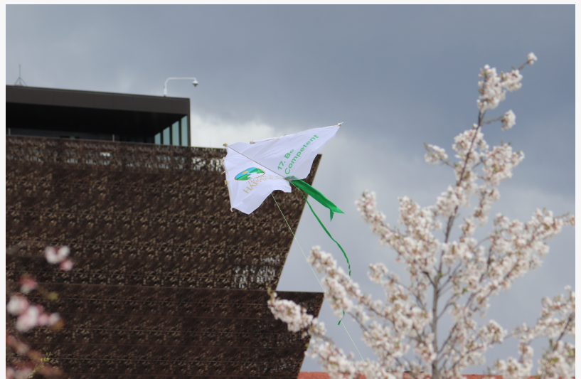
"Be Competent" kite flying in front of the Smithsonian National Museum of African American History and Culture – with cherry blossoms in full bloom.