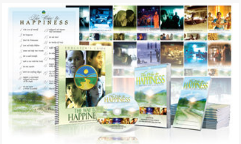
Free Educator Kit for Teachers to help young people learn common sense morals.

This press release can be viewed online at: https://www.einpresswire.com/article/567013159 EIN Presswire's priority is source transparency. We do not allow opaque clients, and our editors try to be careful about weeding out false and misleading content. As a user, if you see something we have missed, please do bring it to our attention. Your help is welcome. EIN Presswire, Everyone's Internet News Presswire™, tries to define some of the boundaries that are reasonable in today's world. Please see our Editorial Guidelines for more information. © 1995-2022 IPD Group, Inc. All Right Reserved.