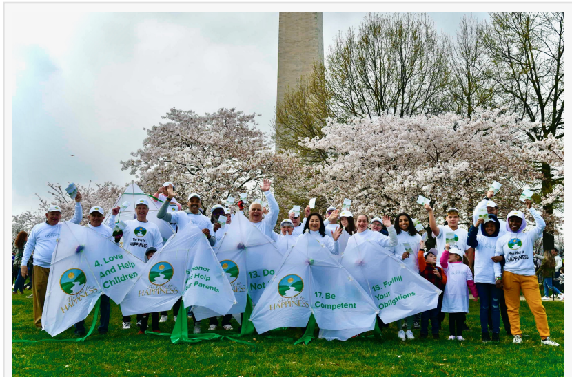
The Way to Happiness kites spread common sense messages. Volunteers enjoy the Cherry Blossoms at the Washington Monument.

That mission is accomplished on a grass-roots level, worldwide, by individuals who share The Way to Happiness book with others and so bring about an increase in tolerance and understanding between families, friends, groups, communities, nations, and Mankind—making a