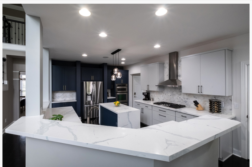
etherium® By E-Stone Statuario

MIAMI, FLORIDA, UNITED STATES, April 4, 2022 /EINPresswire.com/ -- Renovation Redefined: Imagine an out-of-the-box home remodeling franchise system that not only offers products that have revolutionized the home improvement industry, but also provides tremendous lead generation opportunities thanks to a new partnership with a national big box chain.