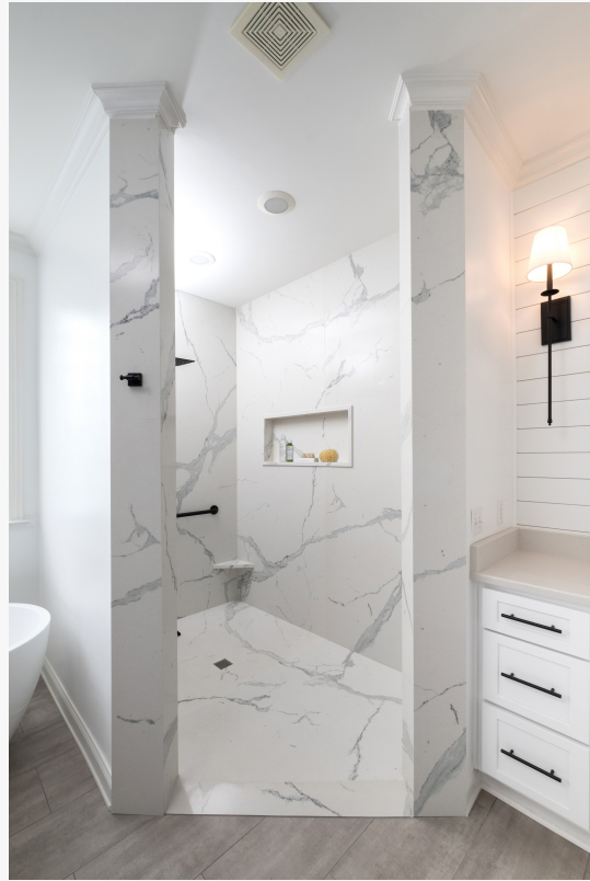
etherium® By E-Stone Statuario

Do-It-Yourself lumberyards across the United States amassed revenues of $103.6 billion in 2019.