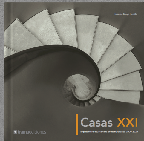
Libro Casas XXI. Arquitectura Ecuatoriana contemporánea 2000-2020. Trama Ediciones. Quito, Ecuador.