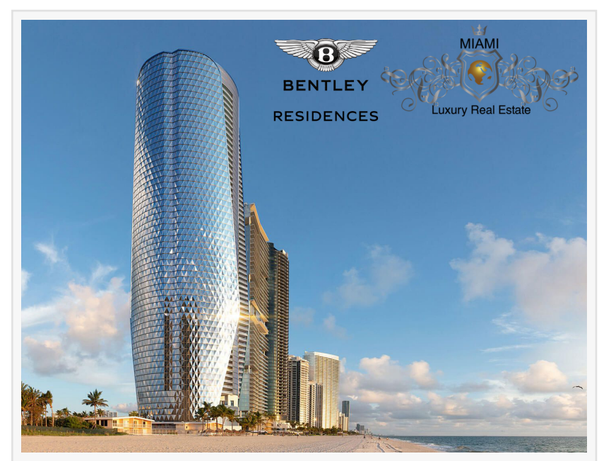
Bentley Residences Miami

Miami's premier luxury real estate company and was awarded by Luxury Lifestyle Awards for Best Real Estate Agency in Florida, USA 2021 and the team is a preferred authorized broker to sell the sought-after Bentley Residences. The dynamic real-estate