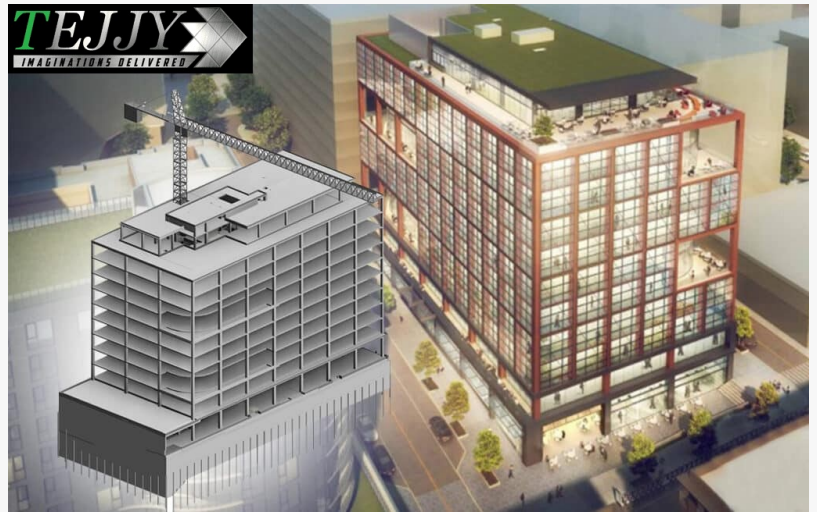
Explore BIM Engineering for AEC with Tejy Inc. in USA

ROCKVILLE, MARYLAND, USA, March 31, 2022 /EINPresswire.com/ -- The Building Information Modeling Market is expected to rise from USD 4.5 billion (2020) to USD 8.8 billion (2025) at a CAGR of 14.5%. The world's inhabitants are anticipated to grow to 8.1 billion in 2025 and reach 10 billion by 2050. Factors driving the growth of the BIM market are increased urbanization along with the development of the infrastructure projects, provided by BIM services for the AEC sector. The enhanced government mandate for BIM is also accelerating the demand for BIM engineering services .