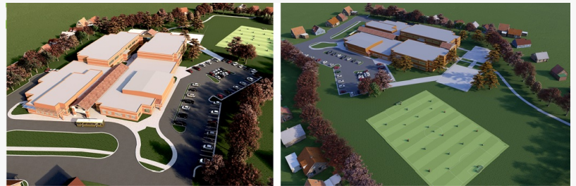
Drone Mapping Services