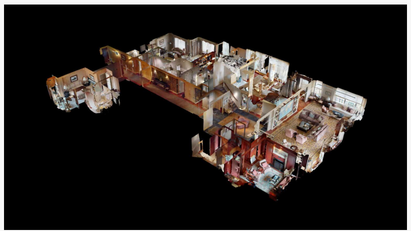
3D Laser Scanning Services