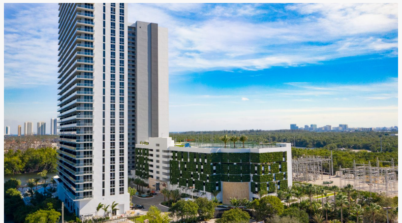
Vistafolia Artificial Living Walls At The Harbour Hotel