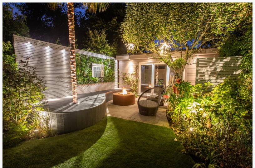
Vistafolia Faux Living Walls In Urban Garden

Since the panels are perfectly interlocked thanks to the variety in patterns and the compact planting, no join lines or squares can be seen because the panels perfectly interlock. The Vistafolia® Artificial Living Wall Panels create a tapestry of textures and colors with 72 lush plants and 16 different types of plants on each panel.