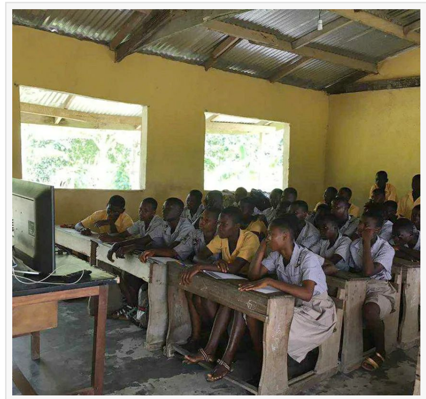
Students in Ghana

With the mission of helping bring an end to child poverty, it's a goal of Village Book is to keep students in school as long as possible. It's with