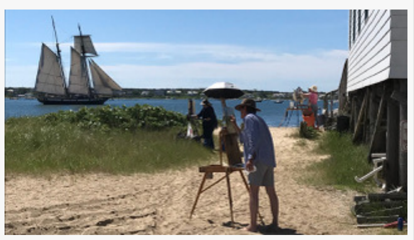
Artists Association Plein Air Festival