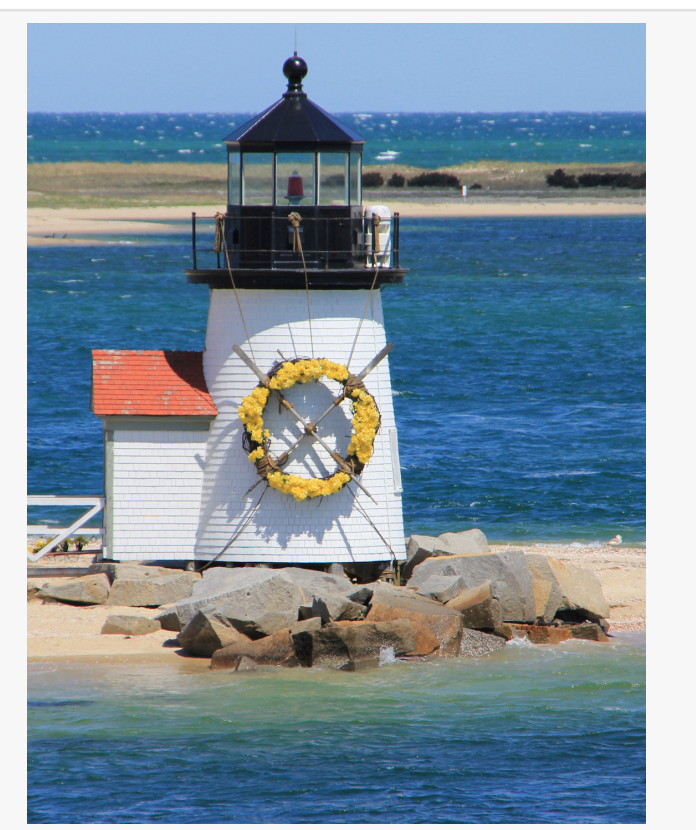
A daffodil wreath on Brant Point Lighthouse on Nantucket.

On Daffy Saturday, April 23, the festival fun begins at 9:15 am, when dozens of antiques cars and some antique