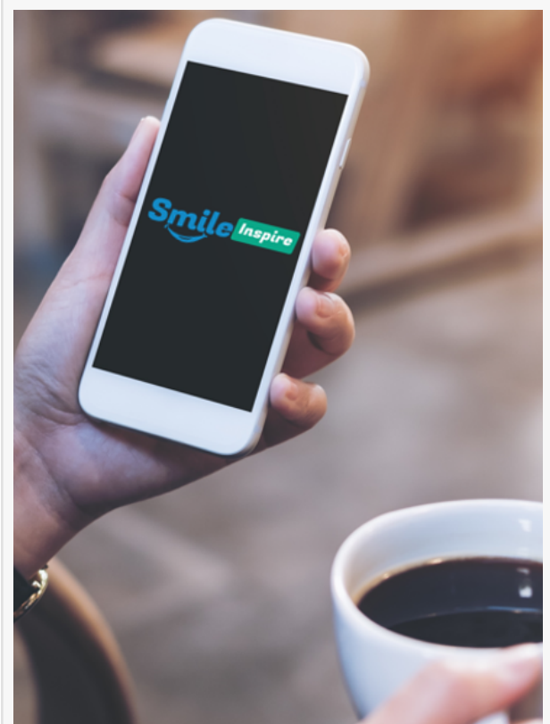
SmileInspire Patient Engagement App

Henry Schein One, a joint venture between Henry Schein, Inc., and Internet Brands, is a software company providing integrated software and services to the dental industry. Headquartered in American Fork, Utah, the company offers market-leading solutions for dental practices, including Dentrix®, Dentrix Ascend®, Dentrix® Enterprise, Jarvis Analytics™, Easy Dental®, TechCentral™, Demandforce®, Sesame Communications, Lighthouse360®, Officite, and DentalPlans.com® as