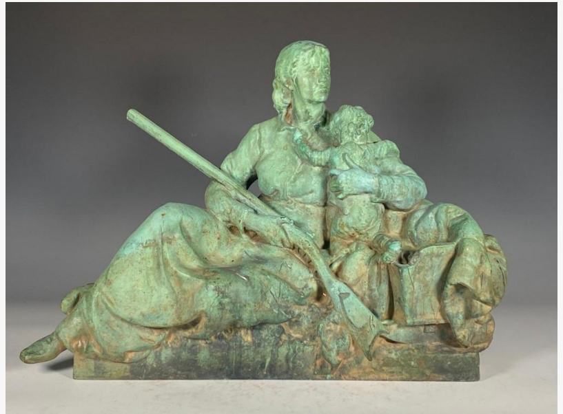
One of two bronze statues with green verdigris patina signed by Frederick William MacMonnies (American, 1863-1937), this one titled Pioneer Mother, 15 inches tall ($27,060).