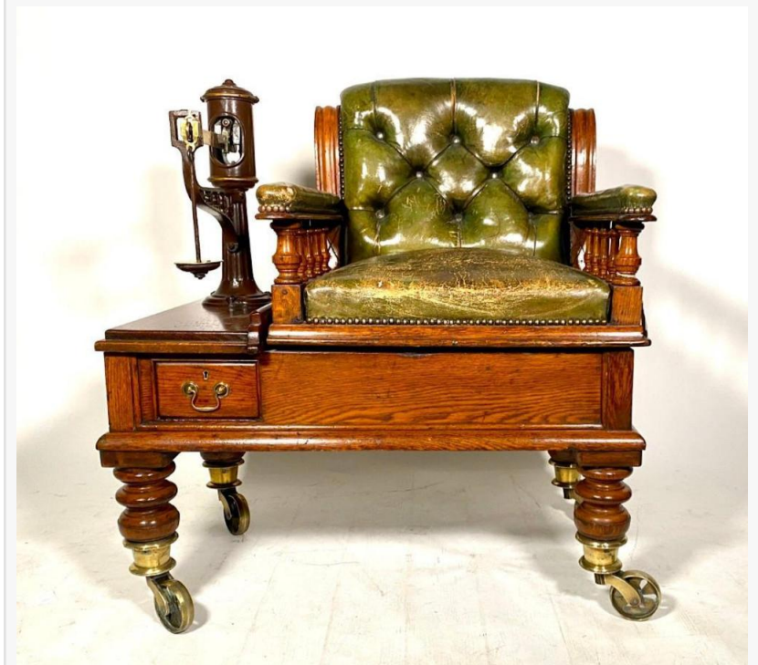
19th century English Regency (or Victorian) oak jockey scale, incorporating a leather upholstered seat with a tufted back over upholstered arms and seat ($9,840).