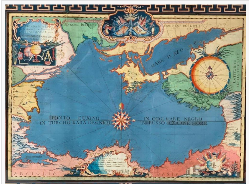
Gouache on paper titled Map of the Black Sea (1779), by the Italian cartographer Giacomo Baseggio and nicely housed in a 24 inch by 31 ½ inch frame ($5,228).

Equestrian-themed paintings also came up for bid. These included an oil on canvas by John