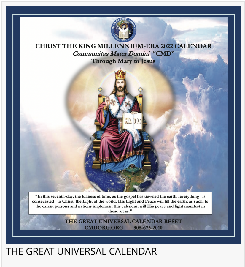
THE GREAT UNIVERSAL CALENDAR

Community of the Mother of the Lord, is a 501C 3 organization in New Jersey, where The Holy Spirit, is the Founder and Administrator of CMD, the Inspirer of the Word of God, Whose grace has prompted the words and actions throughout His organization. Our motto "Instaurare Omnia in Christo" (2 Cor.5:18, Col1:20) is founded on the manifest reign of Jesus Christ in all things among all nations. CMD is introducing the Universal Calendar to reclaim all back to Christ and eradicate paganism which has permeated the Universe and separated God from His people.