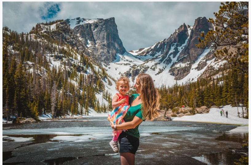
Rocky Mountains

The current economic climate is causing travel costs to increase. Finding an affordable summer vacation is as easy as looking at cooler climates to escape the heat and save on travel costs.