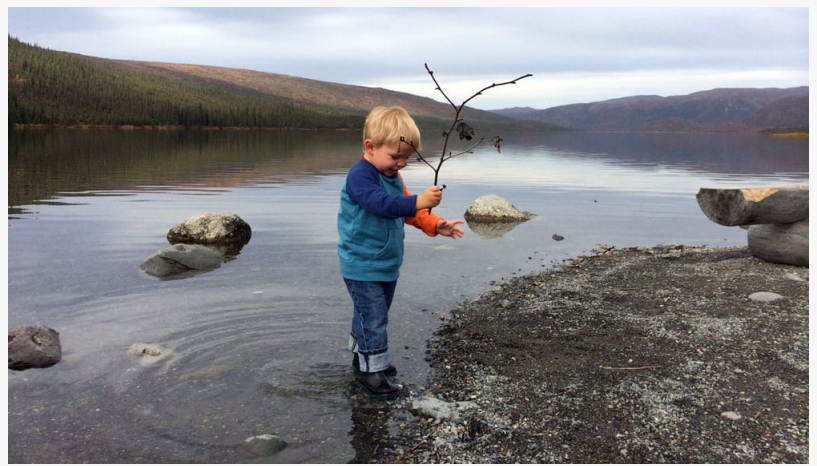
Denali National Park, Alaska

From hiking to lounging by the pool all day, Families Love Travel has the perfect destination for every budget or lifestyle. Families can even make the trip more affordable by camping, glamping, and taking an RV vacation, since the cooler weather will make these options more comfortable. Of course, with the money they'll save on flights to Europe, families can also afford to stay at more luxurious hotels.