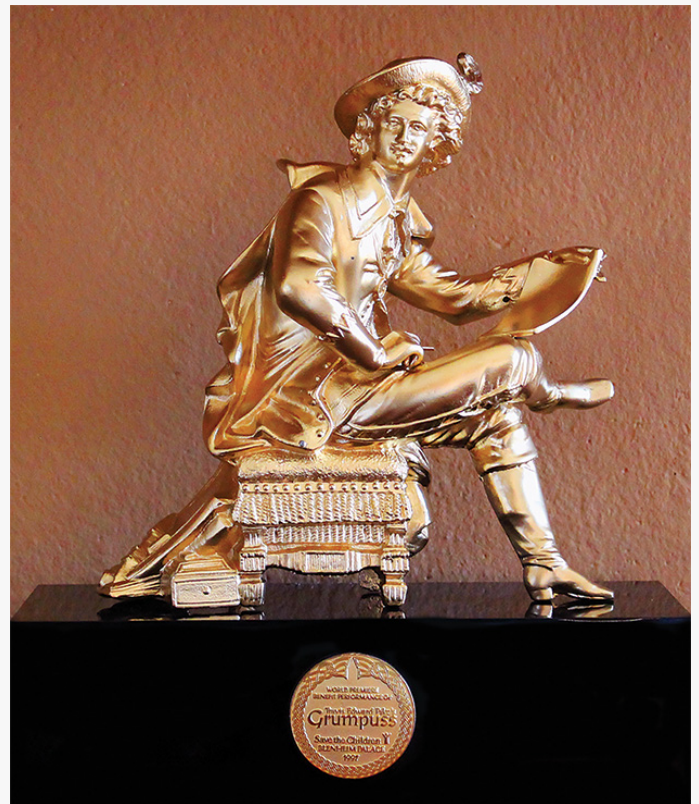
2021 Grumpuss Commemorative Trophy