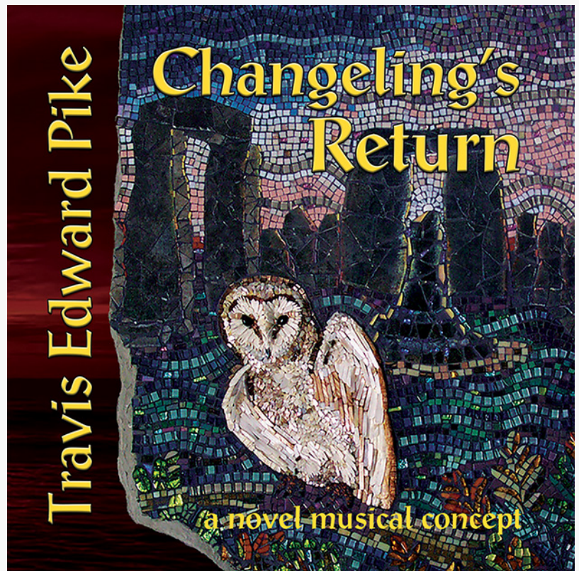
2019 Changeling's Return CD Cover