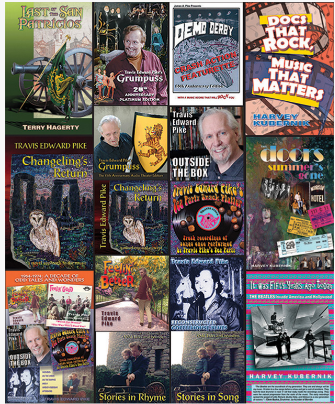
2021 Otherworld Cottage Catalog

In 1977, Pike's "Changeling" musical was optioned by Cine-Media International. Although Travis worked on a number of different movies in a number of different capacities, that original "Changeling" was never funded. Pike is celebrated today for writing, producing and performing his epic narrative rhyme's world premiere of "Grumpuss" at Blenheim Palace, Oxfordshire, England, for the Save the Children Fund. "Grumpuss" won an INTERCOM Silver Plaque at the 1999 Chicago Film Festival, and the reviewer for the October 1999 "School Library Journal" wrote, "This original narrative poem written and told by American storyteller Travis Edward Pike is a wonderful story laced with thought-