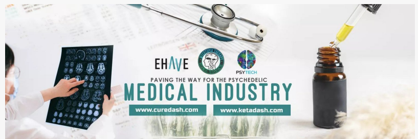
EHVVF in the Medical Industry