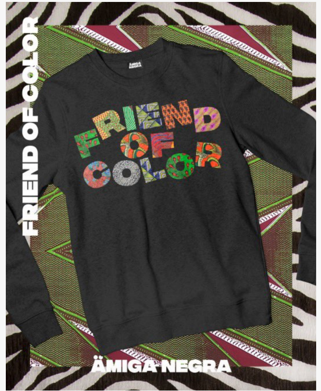
Friend of Color Gear