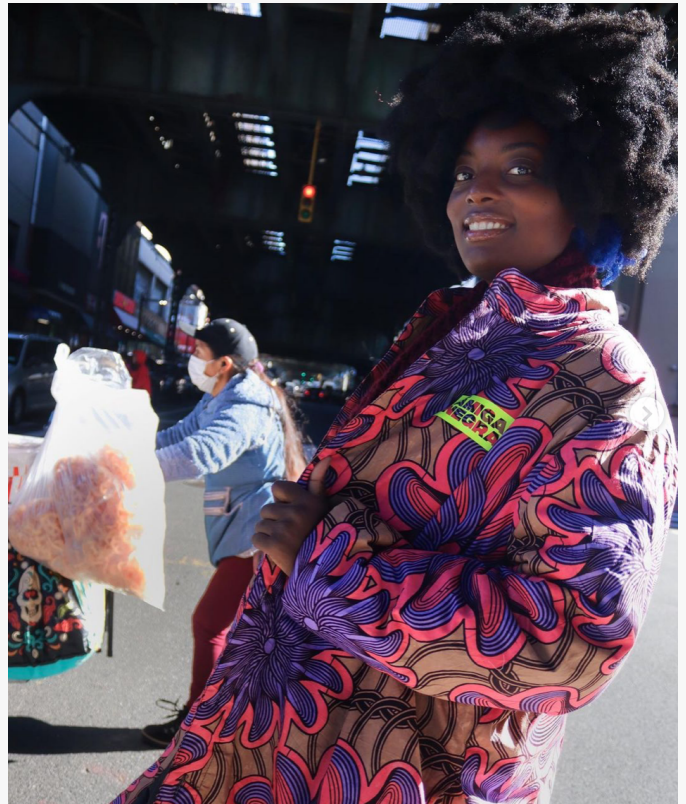
Model Wearing an Amiga Negra Duster Jacket in NYC