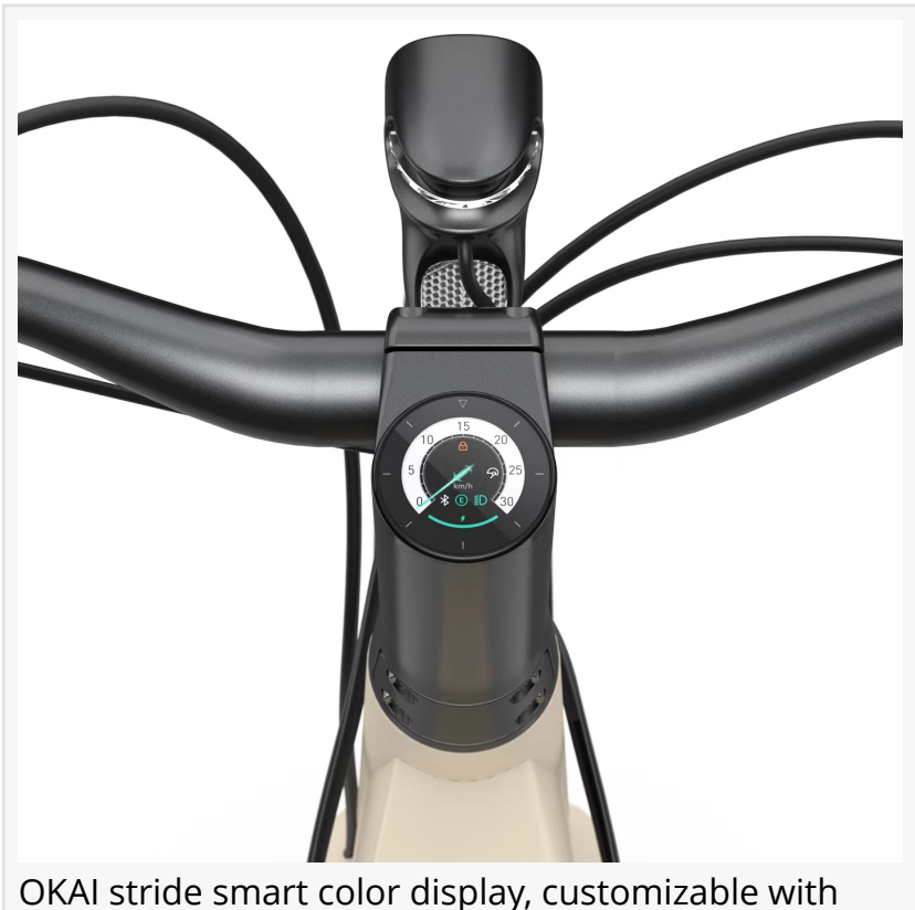
OKAI stride smart color display, customizable with OKAI APP

2. Excellent built quality with worldclass components such as LG battery cells, Shimano gear transmission, Bafang motor, Tretko brake system, and more