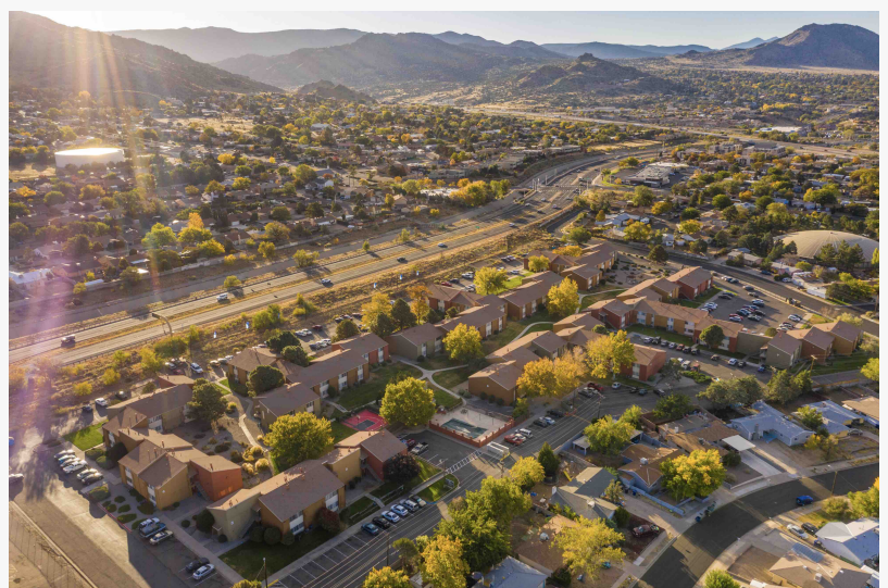
San Diego-based Tower 16 Capital Partners has acquired Copper Ridge Apartments, a 180-unit multifamily property located in Albuquerque

remain firm in our conviction the market will continue to see an in-migration of people from more expensive markets driven by the increasing job opportunities in the area as well as the low cost of living.”