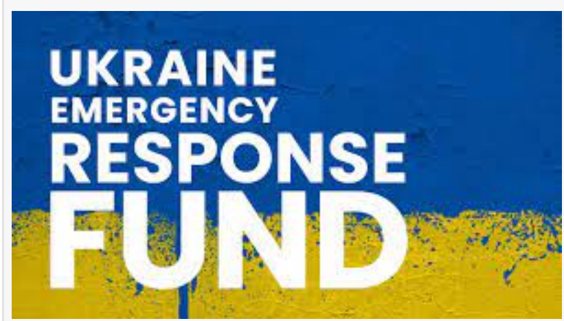
Ukraine Relief Emergency Response Charity Donors Mailing List

How Sprint Data Solutions Worldwide Started