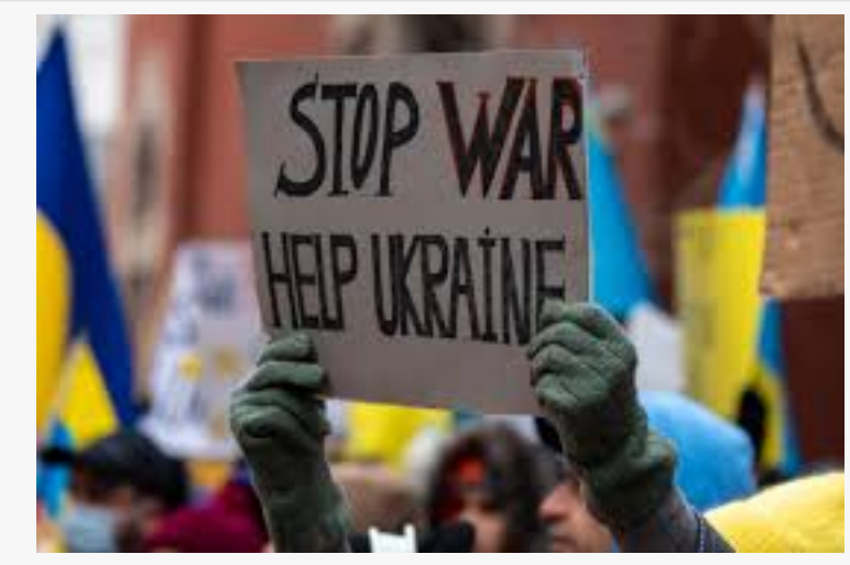
Ukraine Stop War Supporters Mailing List

Today, Sprint Data Solutions Worldwide Marketing has expanded beyond its starting days of servicing Las Vegas. It now provides databases for the entire country, including Hawaii and Alaska. For businesses that want complete coverage of North American markets, databases for Mexico and Canada are