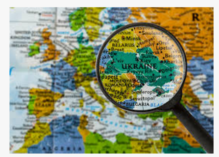
Ukraine & Europe Relief Project Donors Mailing List

also available. Even companies that are ready to move onto the international arena have options. It's possible to get lists from across the Atlantic for those businesses prepared to enter European Union markets.