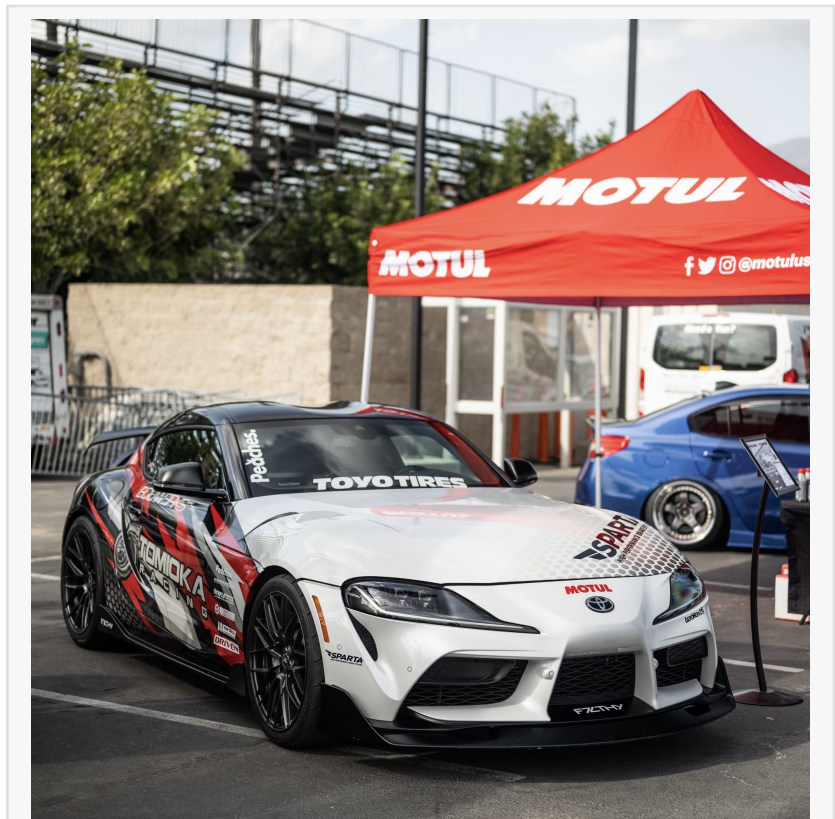
TR's Toyota Supra with Motul at car show