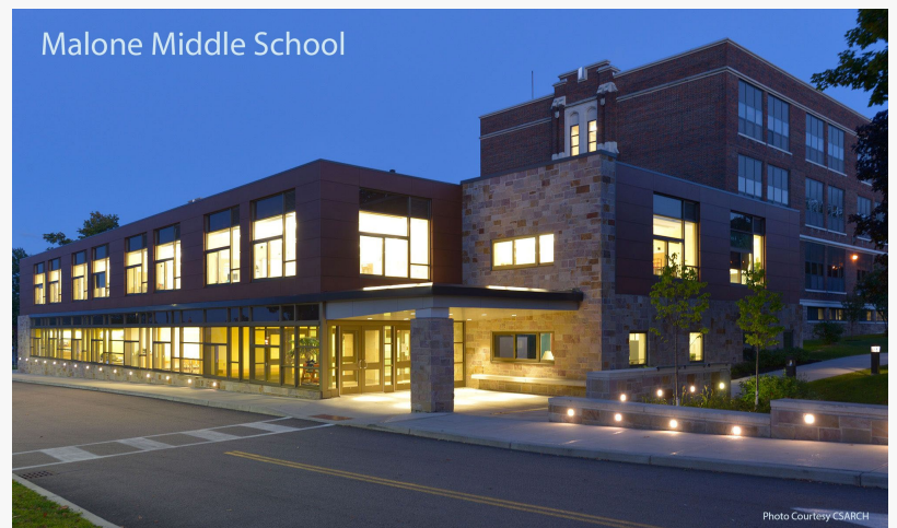
Malone Middle School

Energia means maximum energy savings guaranteed