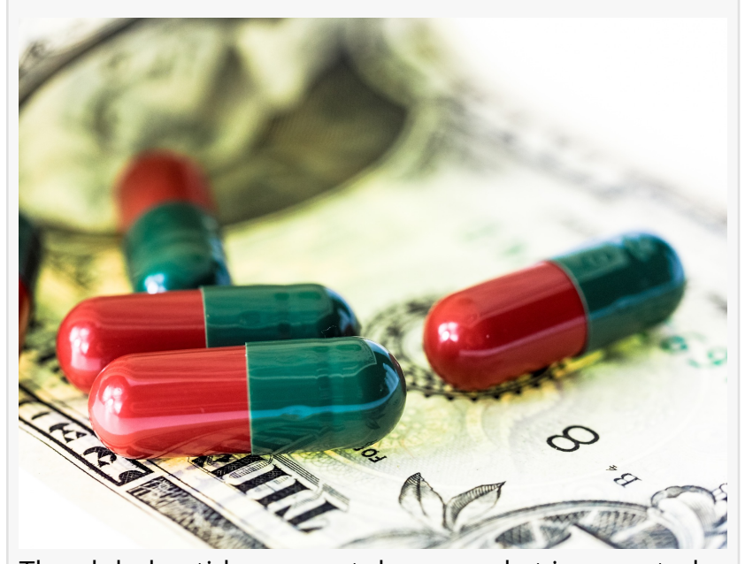
The global antidepressant drugs market is expected to reach $15.98 billion by 2023 despite studies showing these drugs can increase depression.

power, the evening's program will look at some of the ways that mental health solutions actually