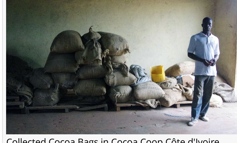
Collected Cocoa Bags in Cocoa Coop Côte d'Ivoire

companies, including Hershey's, Unilever and Ritter, whose cocoa is close to 100% certified by the Rainforest Alliance or Fairtrade.