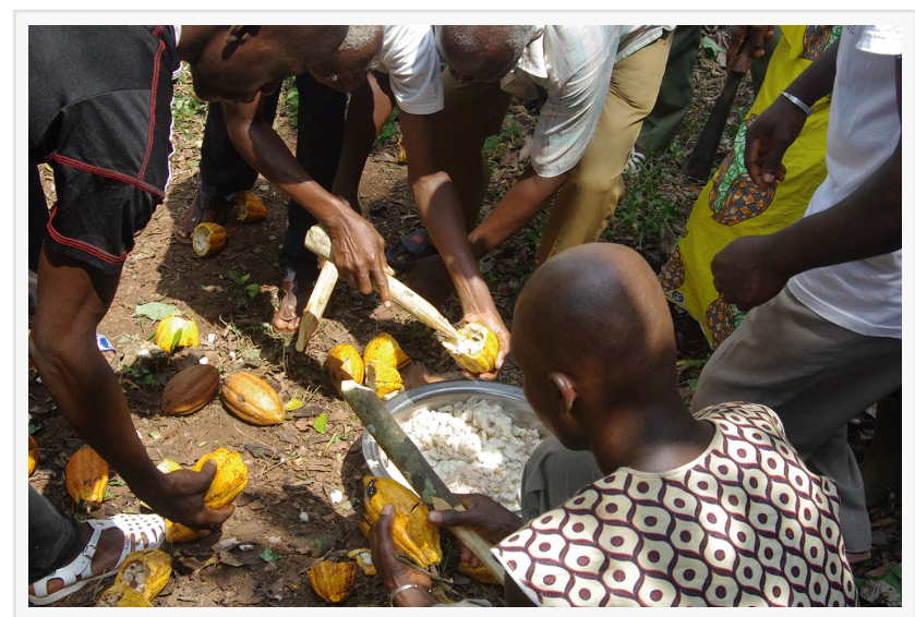
Cracking open cocoa pods to get cocoa seeds in Côte d'Ivoire

While there had been improvements in many areas since last year's survey, the researchers said there was still a long way to go in addressing the issue of