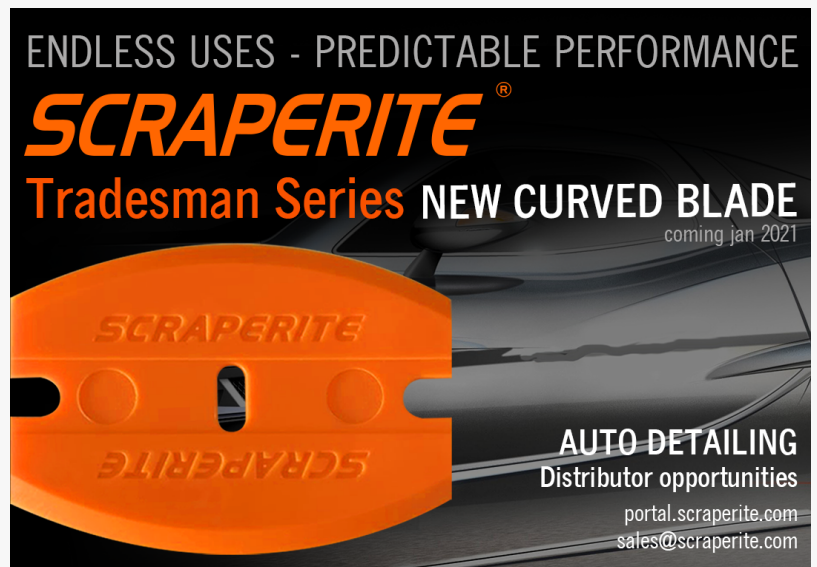
Scrapelite curved blade for auto detailing