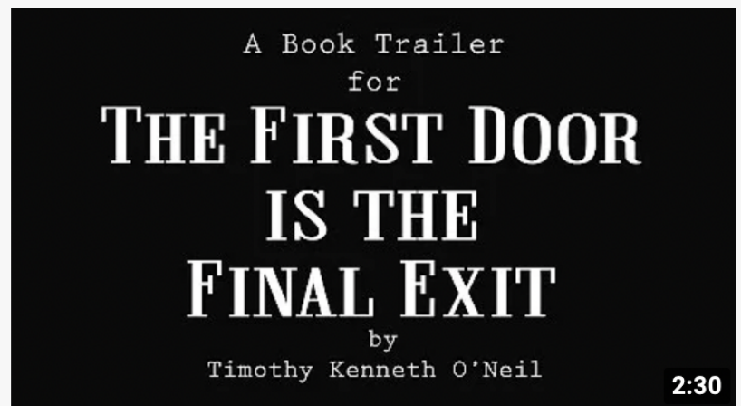
View the Book Trailer