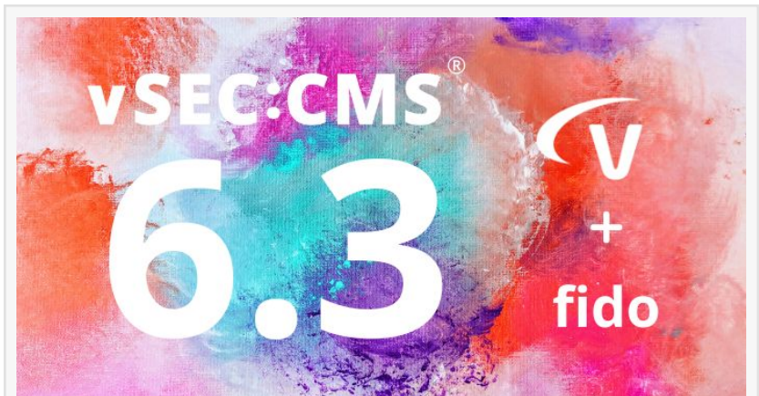
Versasec releases vSEC:CMS Version 6.3

vSEC:CMS now allows administrators to generate a new system master key in HSM using the AES