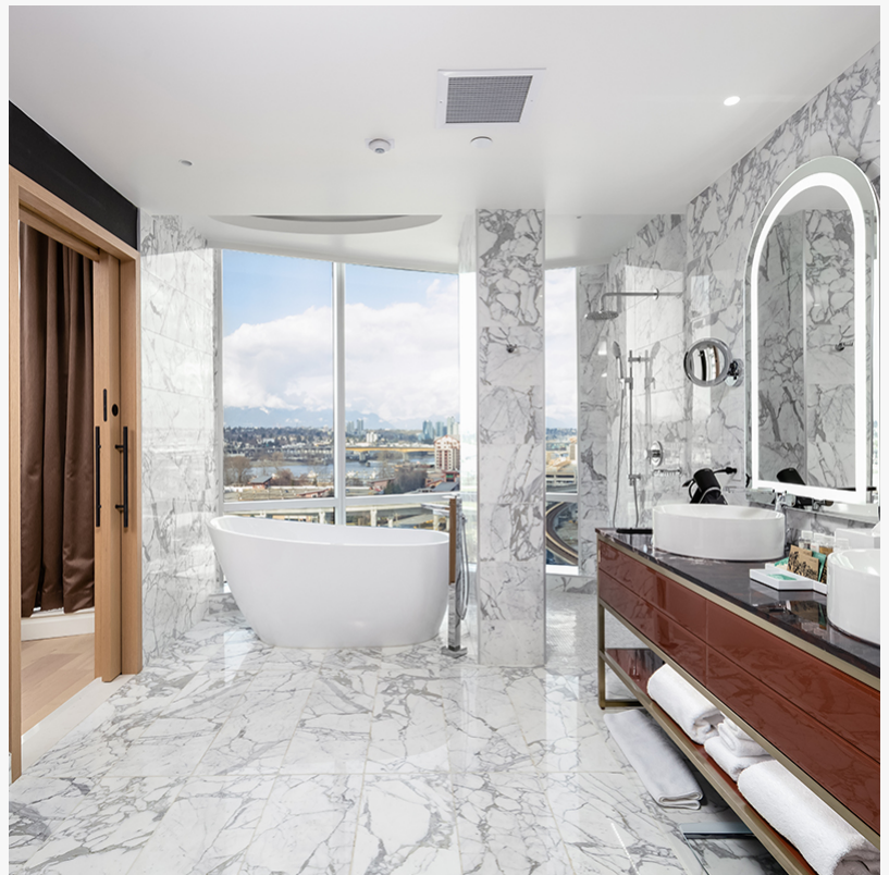
Versante Suite Bathroom