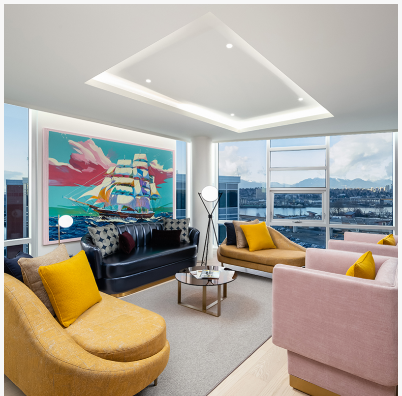
Versante Suite Living Room

The Versante Suite's master bedroom provides a lap of luxury, with: a king-size leather platform bed and chaise lounge; an extravagant master ensuite bathroom clad in floor-to-ceiling calacatta marble, double-sink vanity and freestanding soaker tub overlooking the city, and a show-stopping 100 sq ft walk-in closet with custom millwork and a backlit vanity. The second bedroom