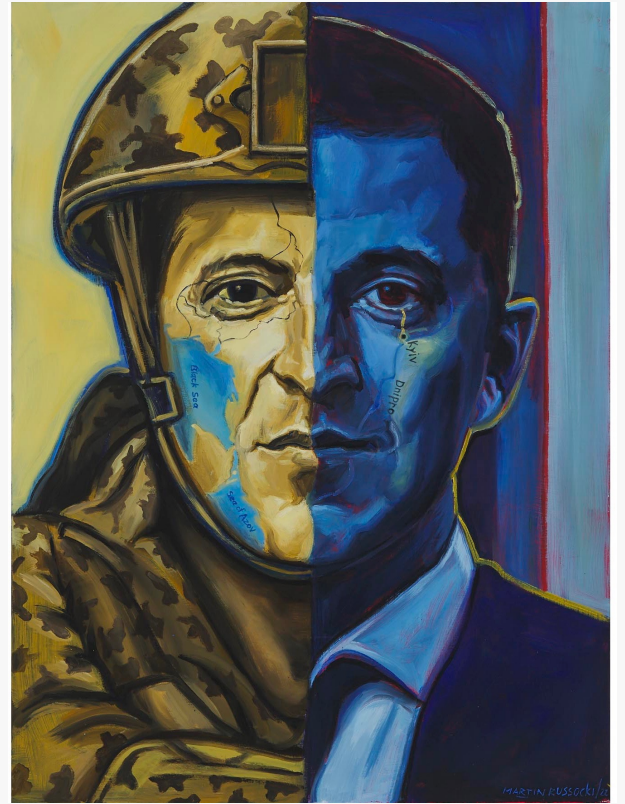
MARTIN RUSSOCKI, THE FACE OF COURAGE, 2022; Oil on canvas