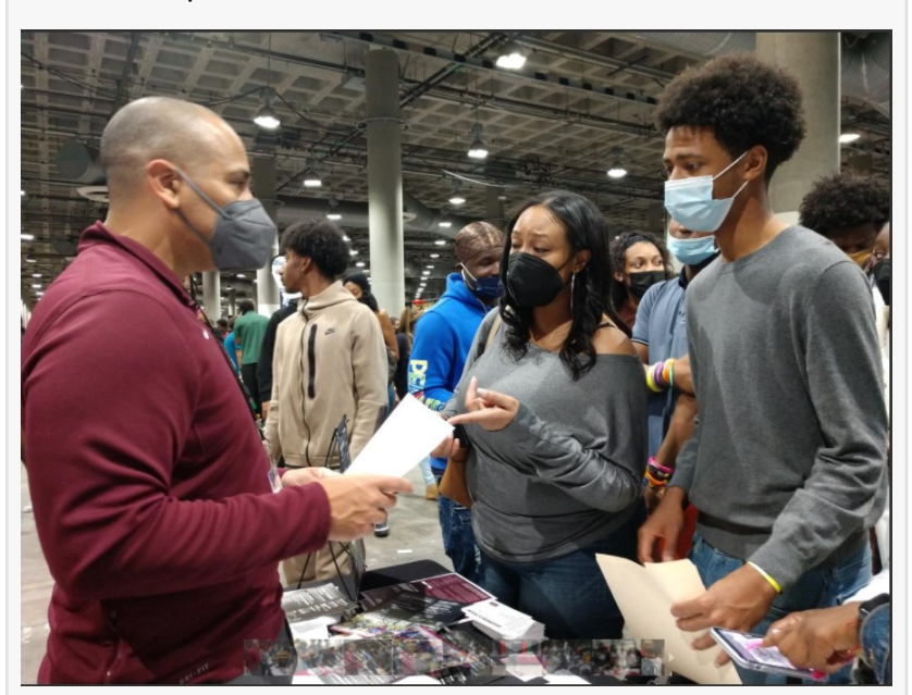
Texas Southern University shares benefits offered to incoming students.

This press release can be viewed online at: https://www.einpresswire.com/article/567612465