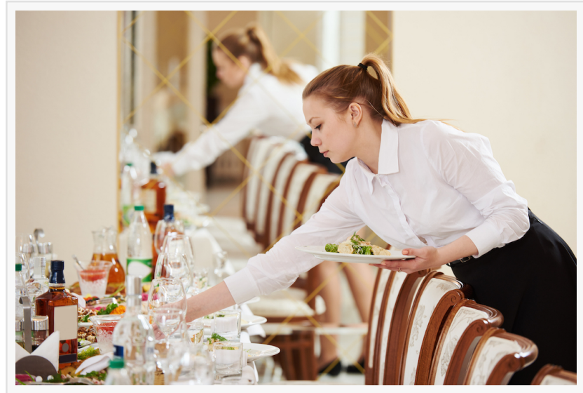
MHIC22 Mauritius Hotel Innovation Conference 2022

authenticity, craftsmanship and sustainability as the pillars, shows a deep focus on entrepreneurship and connection. It is the Hotel Innovation Conference of hospitality, that will transform the prestigious One Only Le Saint Géran in Mauritius into a major business arena in September 2022.