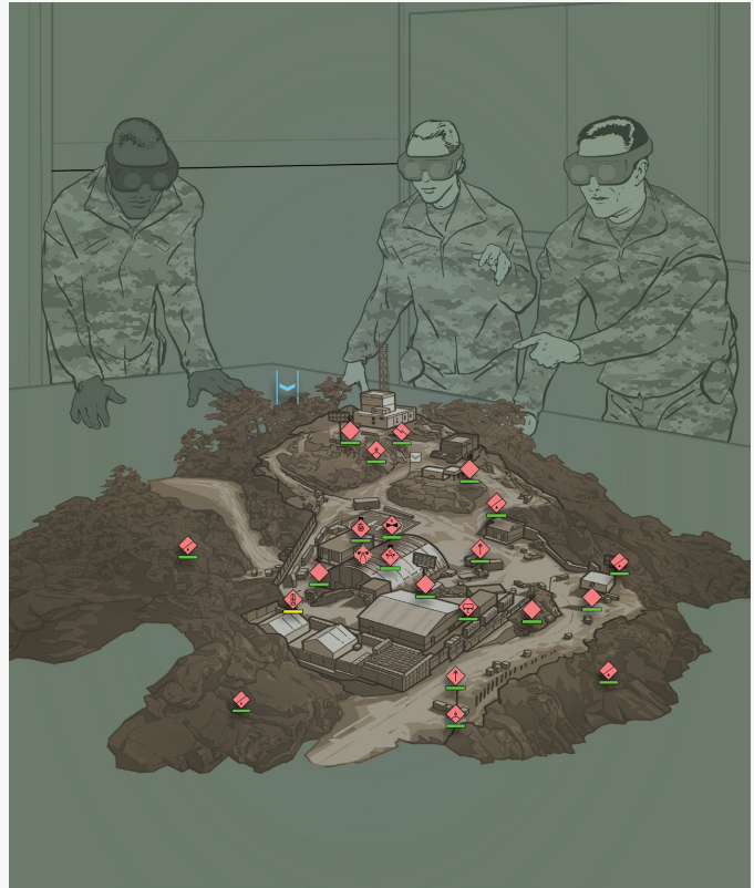
Eolian Simulation Platform ARTAK Visualization