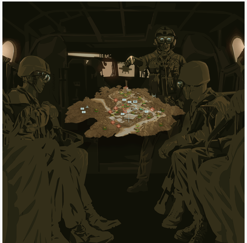
Eolian Simulation Platform ARTAK Visualization 2