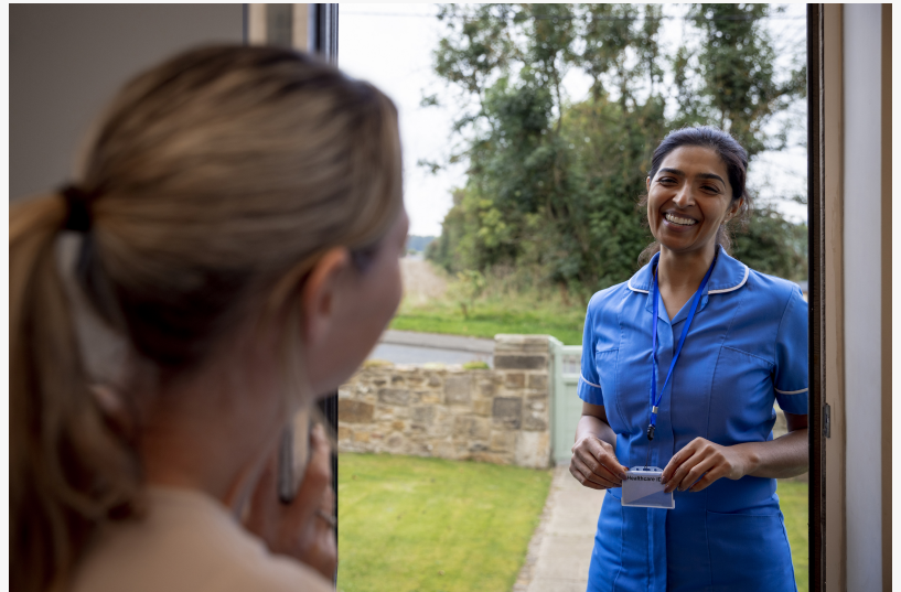
NHS Community Nurse

LONDON, UNITED KINGDOM, April 12, 2022 /EINPresswire.com/ -- Kent Community Health NHS Foundation Trust (KCHFT) has become the first UK health service provider to adopt CriticalArc's SafeZone technology for lone worker protection, staff safety, mass and targeted communications, and emergency response coordination.