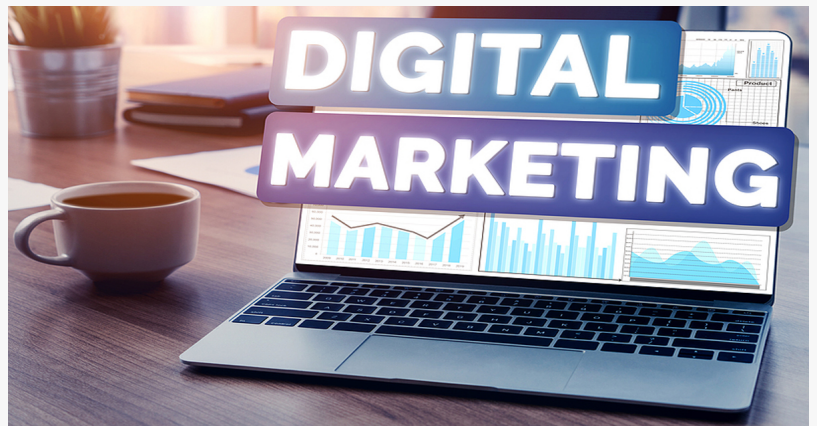
247LiveIT Achieves Recognition As A Google Partner

Based in Chatsworth, California, the agency is certified as a Facebook Marketing, Microsoft Advertising Elite and Amazon Advertising partner. 247LiveIT services include website development, social media platform design and advertising, e-mail campaigns, search engine optimization, graphic design, video content creation and pay-per-click marketing.