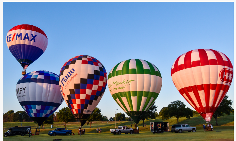
Hot Air Balloons (left to right) RE/MAX, UNIFY, Plano, Central Market and H-E-B at Oak Point Park in Plano, Texas