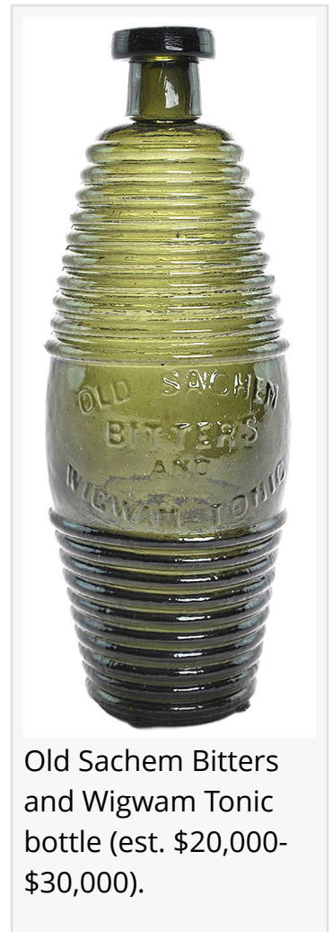
Old Sachem Bitters and Wigwam Tonic bottle (est. $20,000-$30,000).