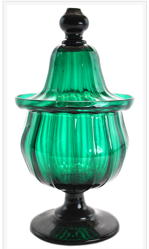
American pattern mold covered sugar bowl, emerald green, possibly Sandwich or Pittsburgh District, circa 1820-1840 (est. $8,000-$12,000).

This press release can be viewed online at: https://www.einpresswire.com/article/567790345