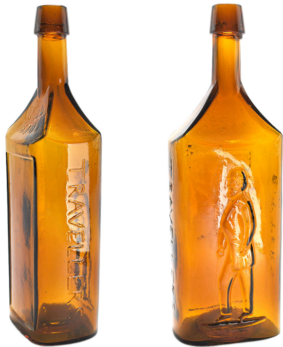
Traveller's Bitters bottle (circa 1834-1870), with motif of a walking man in the likeness of General Robert E. Lee (est. $8,000-$12,000).