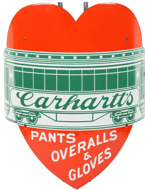
Circa 1905 Carhartt's Overalls single-sided porcelain corner sign, graded 9, 22 inches by 18 inches, featuring a mint green car, produced for the Canadian market (est. CA$5,000-$7,000).

To consign a single piece, an estate or a collection, you may call them at (519) 573-3710; or, you can e-mail them at info@millerauctions.com . To learn more about Miller & Miller