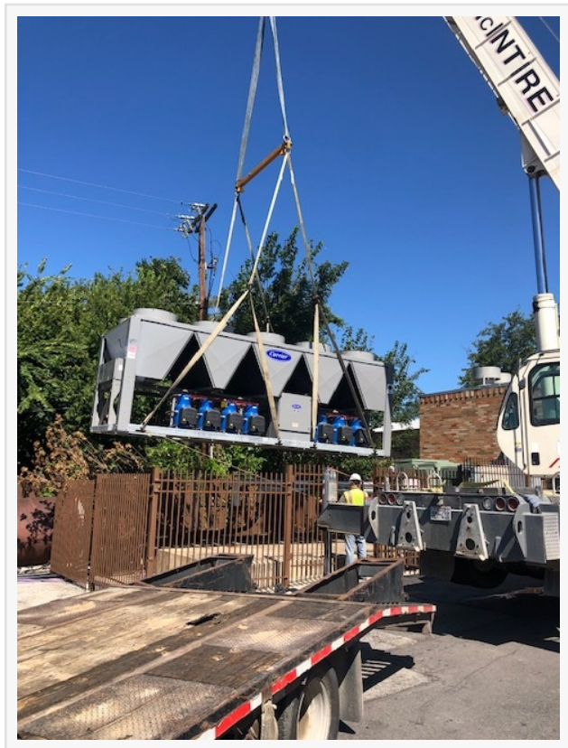
Estrella iPlant Installation

system for a new property located at their highly-anticipated <u>East River</u> project off Buffalo Bayou in the historic 5th ward near downtown Houston. The TEAL iPlant will serve Building C, D, and F. The TEAL System will serve The Laura, the site's multifamily building, and provide an unlimited supply of conditioned hot water. Building C is WiredScore Certified, offerings seamless digital connectivity, and has the flexibility and capacity to adapt to new technologies.