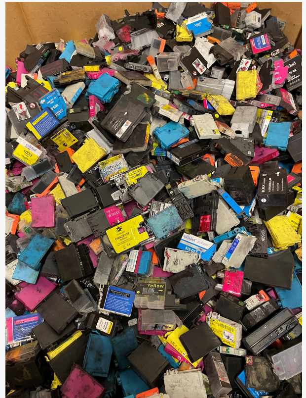
Single Use printer cartridges that can not be recycled

This press release can be viewed online at: https://www.einpresswire.com/article/567896134