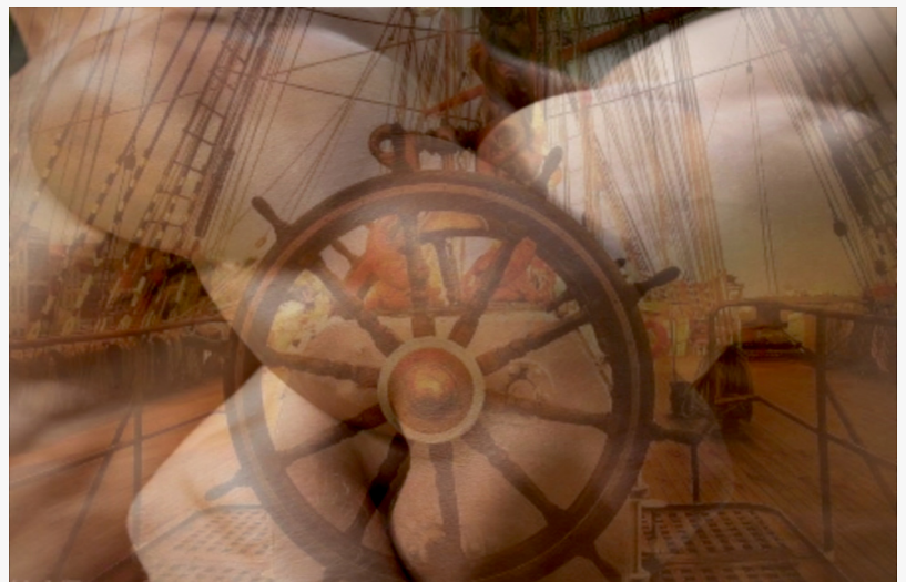
Tallship Helmsman-Series National Acadian Day August 15