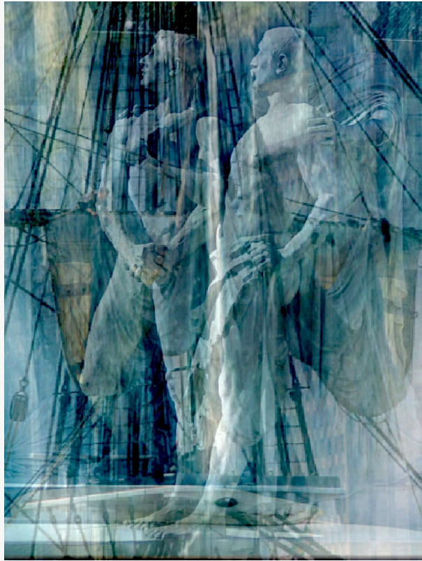
Status-Intrepid-&Vertues-Vertitas-seafaring-Tallship Helmsman-Series National Acadian Day August 15

Mainstream Halifax-centric media outlets do not seem to want to acknowledge French Acadian events outside of the HRM. Hence the need for Web 3.0 optimized social media profile management that is worldwide press release savvy, so that a cultural voice gets heard through the partisan politics endemic in Atlantic Canadian media.