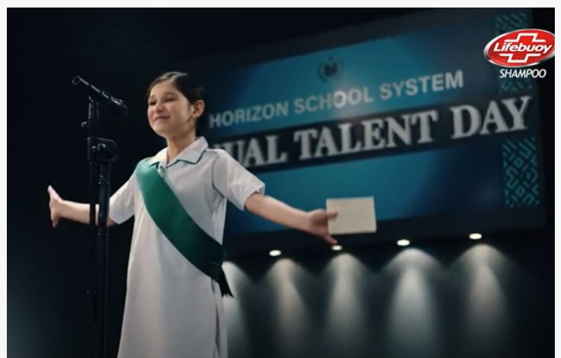
little girl happily reading the new poem