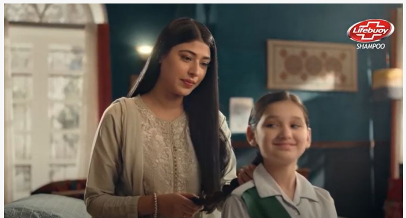
little Girl with mother