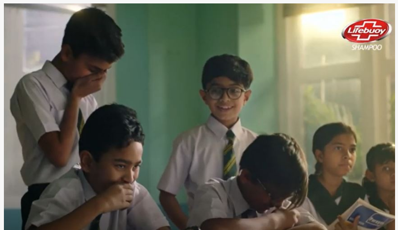
boys laughing at the girl when she's reading the poem

Murad Raas, Honourable Minister for School Education Punjab: "The Punjab government is actively working towards generating better education opportunities for our children. We are