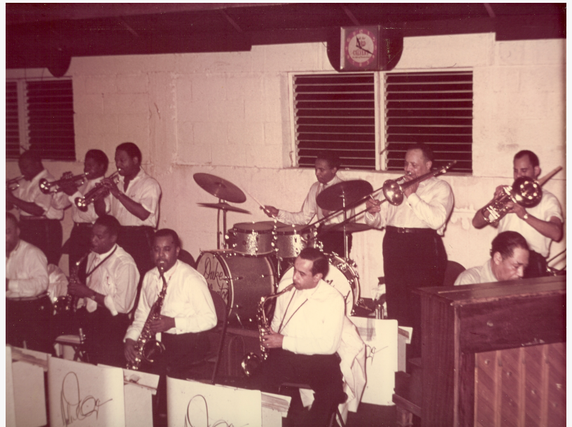
Duke Ellington performing at the Sunset Lounge