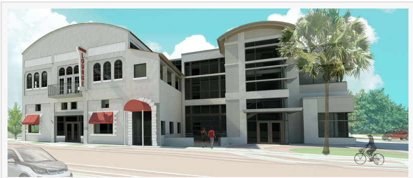
Rendering of the newly renovated Sunset Lounge

http://wpb.org/government/procurement/solicitations/bids-list .