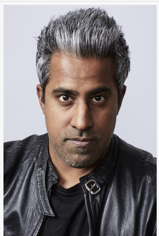
Author Anand Giridharadas