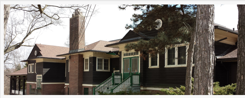
Cherry Blossom Watch is supported by the kindness and generosity of donors.

This webpage is updated on a regular basis with photos showing the various