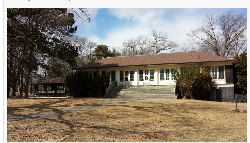
The Nature Centre helps bring the wonder and beauty of cherry blossoms to Torontonians by dedicating a portion of its website, social media, and staff to the Cherry Blossom Watch.

stages of the blossom development for the season. Also included is an interactive map showing the location of all the cherry trees in High Park. Curious nature lovers can use this webpage as their primary starting point to learn more about the cherry blossom season in High Park.